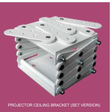
PROJECTOR CEILING BRACKET (SET VERSION)